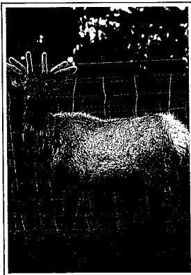
The challenge is to work out ways to ensure that animals destined for slaughter in the spring keep growing through the rut and the winter. Two possibilities are to slaughter young animals and to maintain growth without using hormone treatments.

The optimal time to slaughter from a biological efficiency perspective would be at the end of the spring-summer growth period. However, even though it's becoming a cliché, the system must be market led. Therefore we have to work out ways of meeting the pattern of demand. Put simply, flexibility is the answer — flexibility in terms of the spe-