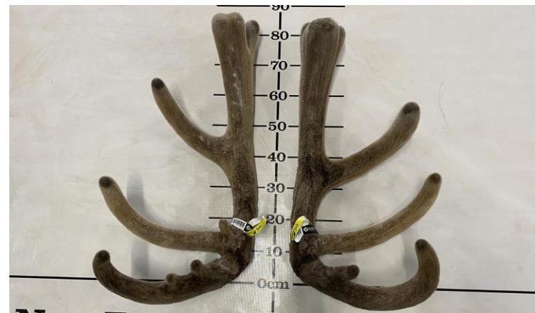
New Zealand Elk and Wapiti ciety Velvet Antler Competiti 2nd ciety Velvet Antler Competiti 3nd Ciety Velvet Antler Competiti