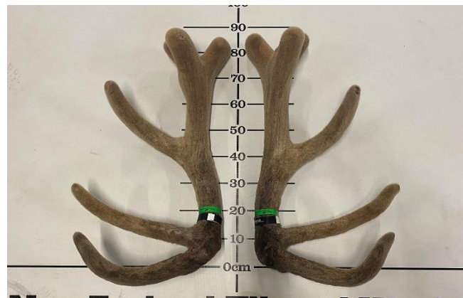
New Zealand Elk and Wapiti ciety Velvet Antler Competitio