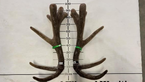
New Zealand Elk and Wapiti 3<sup>rd</sup> Society Velvet Antler Competitio