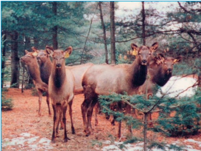
A group of cows that have been AI'd.

of frozen-thawed sperm cells does NOT equal fertility; just because a sample of semen has good motility does not necessarily mean the fertility is good.