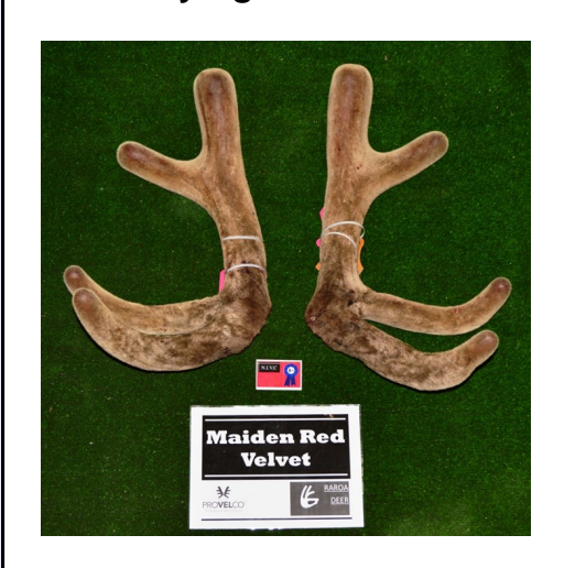
PUKETOTARA DEER FARM